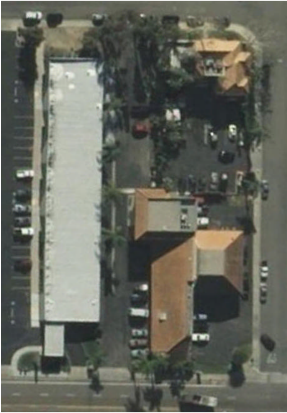
505 Grand Ave. In San Marcos, Ca. 92078